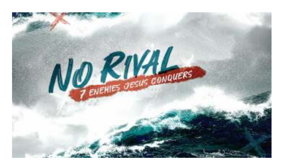
The Enemy - Death